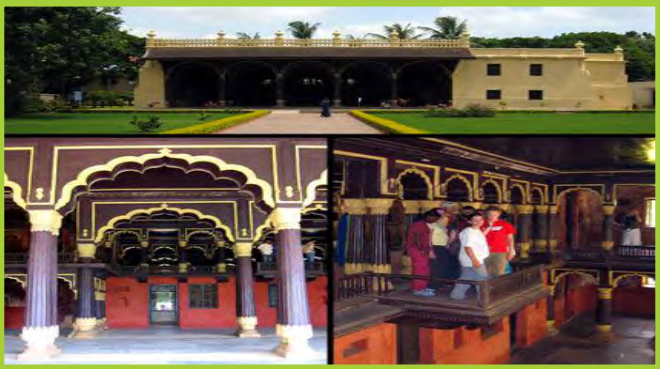
Tipu Sultan's Palace