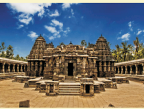
Somanathapura 40 km