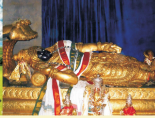
Sri Ranganatha Temple Bluff 45 km