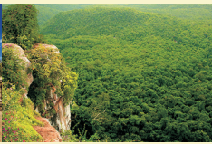
B.R. Hills 35 km