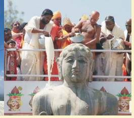
Kanaka Giri 25 km