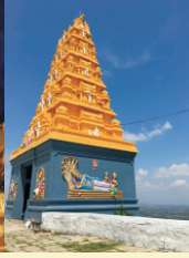
Hulugana Muradi Temple 29 km