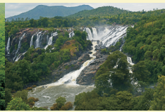
Bharachukki Falls 50 km