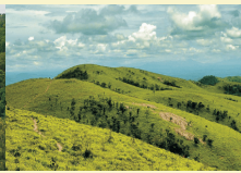
Gopalswamy Betta 45 km