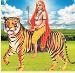
Sri Male Mahadeshwara Hills 120 km