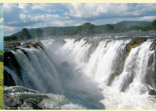
Hogenakal Falls 145 km