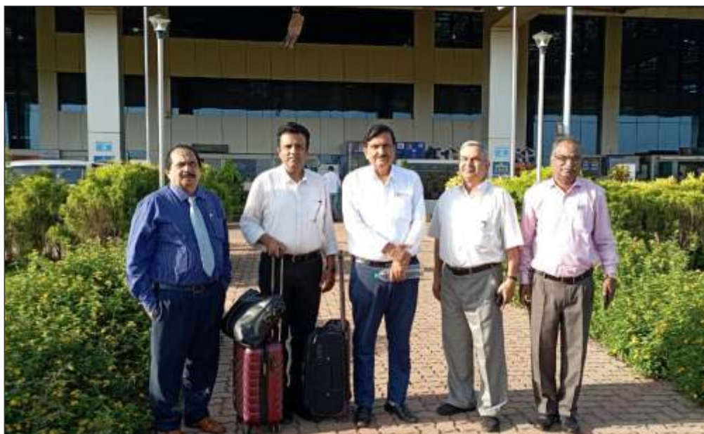
National President Arrived at Hubli Airport