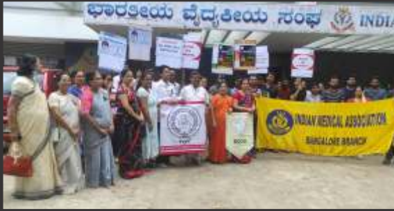
Doctors in medical institutions working with Black badges