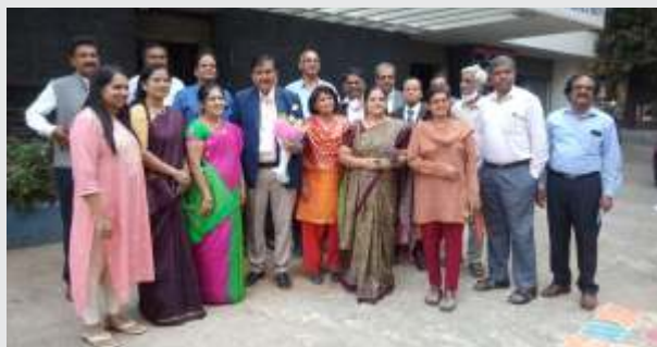
IMA National President visit to IMA Karnataka State Branch