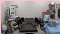
Modular OT with AHU