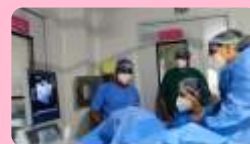
Gynaecologist fellowship training courses