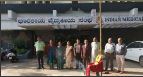
Republic Day was Celebrated at IMA KSB Building