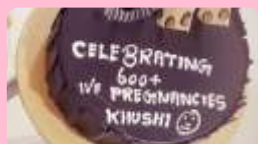
Excellent Success Rates