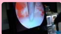
Stem cell therapy for thin endometrium