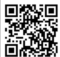
IMA KPSS APPLICATION FORM