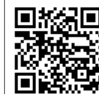
IMA KSHS APPLICATION FORM