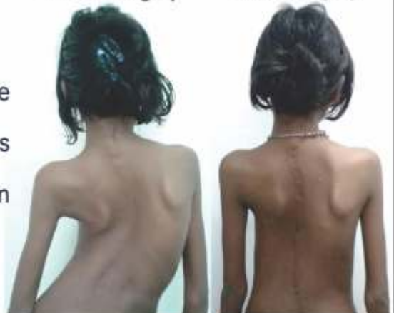
• After Surgery

No. 472 [new Number 25], Near Sangam Circle, Jayanagar 8th Block, Bengaluru. India