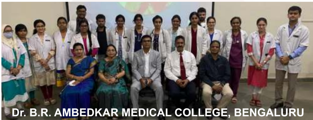
Dr. B.R. AMBEDKAR MEDICAL COLLEGE, BENGALURU