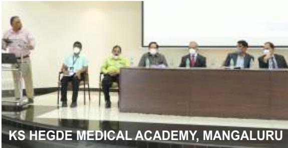
KS HEGDE MEDICAL ACADEMY, MANGALURU