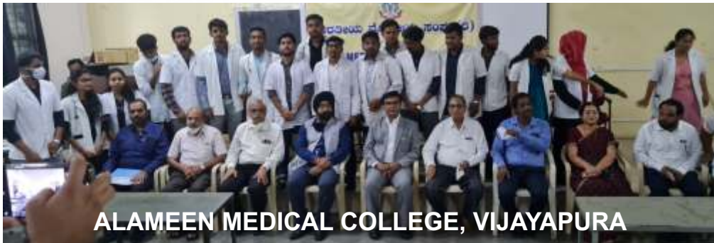
ALAMEEN MEDICAL COLLEGE, VIJAYAPURA