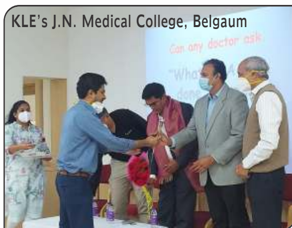
KLE's J.N. Medical College, Belgaum