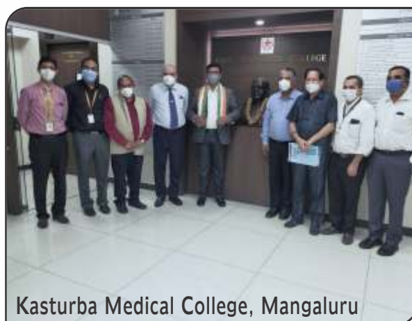
Kasturba Medical College, Mangaluru