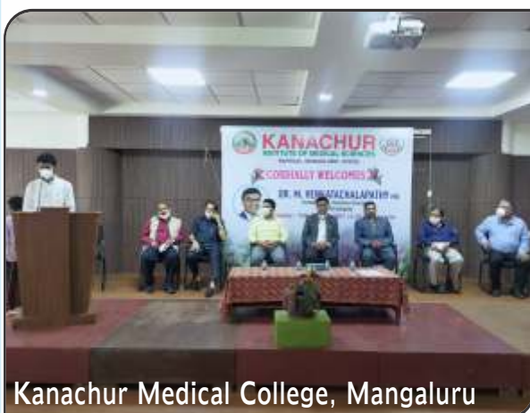
Kanachur Medical College, Mangaluru