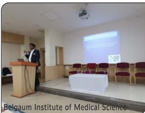
Belgaum Institute of Medical Science