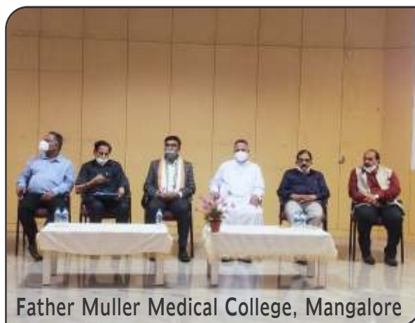
Father Muller Medical College, Mangalore