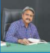
Chief Medical Director