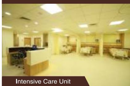
Intensive Care Unit