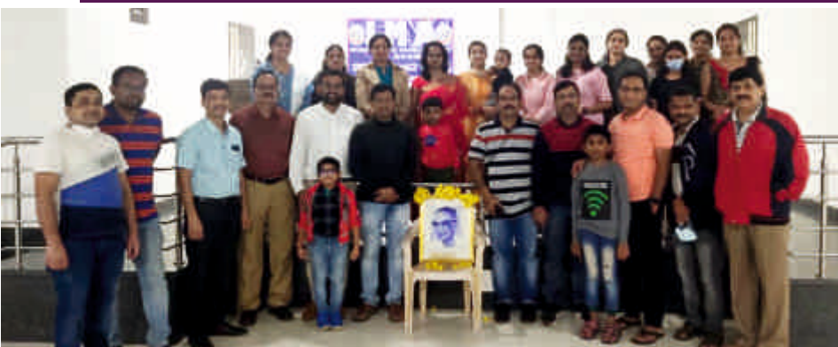
IMA Kadur-Birur Branch conducted Doctors' Day Celebration.