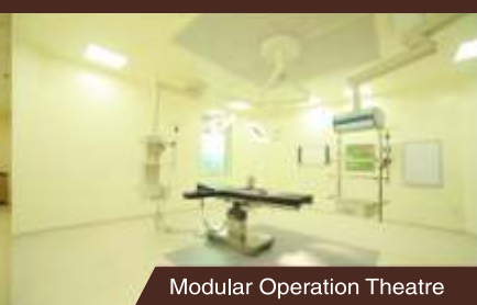
Modular Operation Theatre