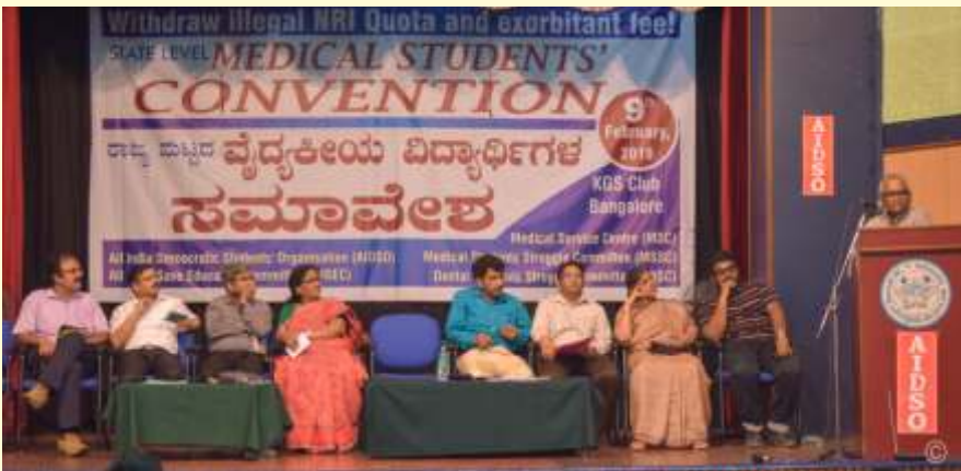
ಬೆಂಗಳೂರಿನಲ್ಲಿ ನಡೆದ ರಾಜ್ಯ ಮಟ್ಟದ ವೈದ್ಯಕೀಯ ವಿದ್ಯಾರ್ಥಿಗಳ ಸಮಾವೇಶ