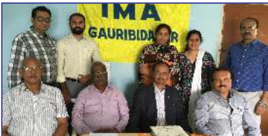
President Visit -Gouribidanur