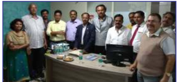
President Visit - Yelahanka