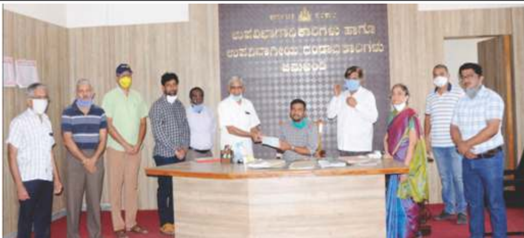
Rs.1 Lakh donated PM Care Fund

By the year 1911, B.C.Roy had completed both his M.R.C.P and F.R.C.S degree in a span of only two years and three months, a rare achievement.