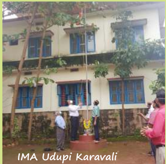
IMA Udupi Karavali