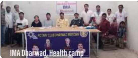
IMA Dharwad, Health camp