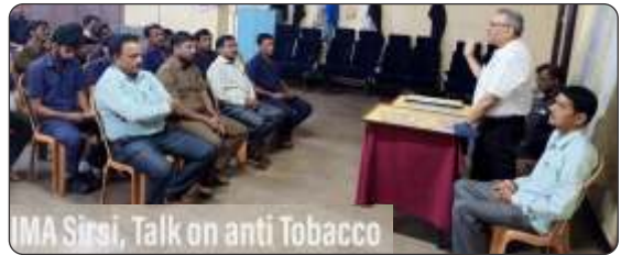
IMA Sirsi, Talk on anti Tobacco