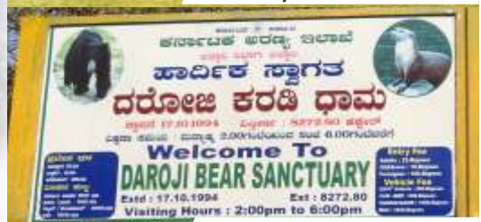
Daroji Bear sanctuary